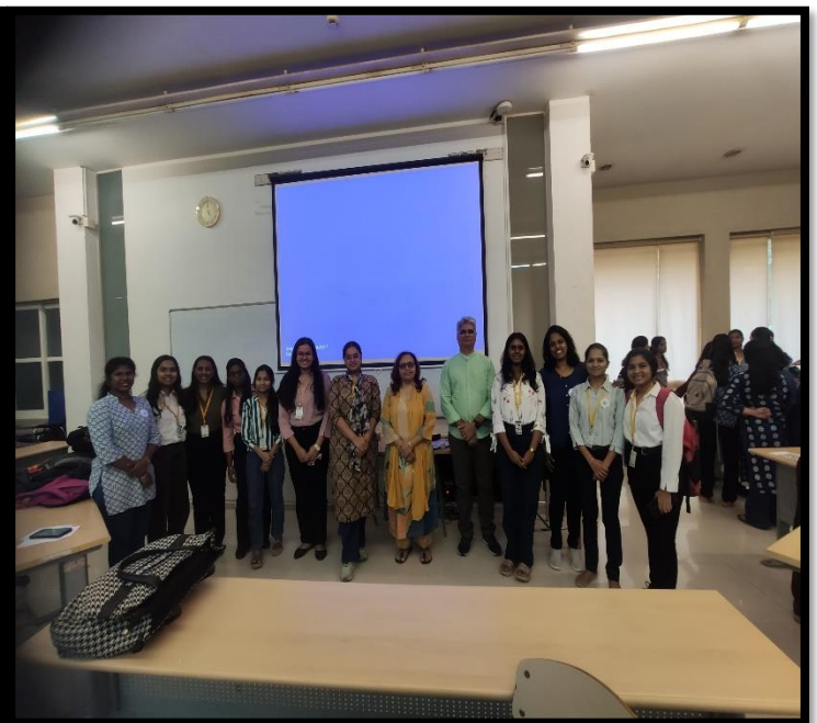
Group picture with Speakers and Students, PTV College, Vileparle